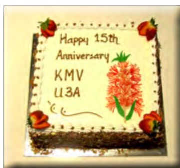
Left: the U3A 15th Anniversary cake.

Happy 15th Anniversary Kempsey-Macleay Valley U3A!