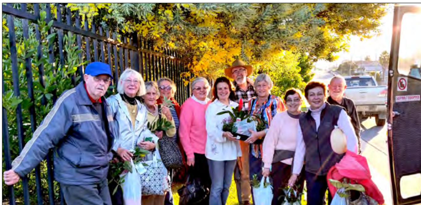
Here are some happy Social Gardeners about to board the bus for Coffs!.