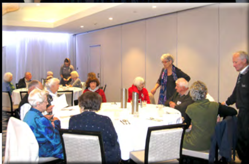
A few of the people attending the 15th anniversary lunch at Kempsey-Macleay RSL Club