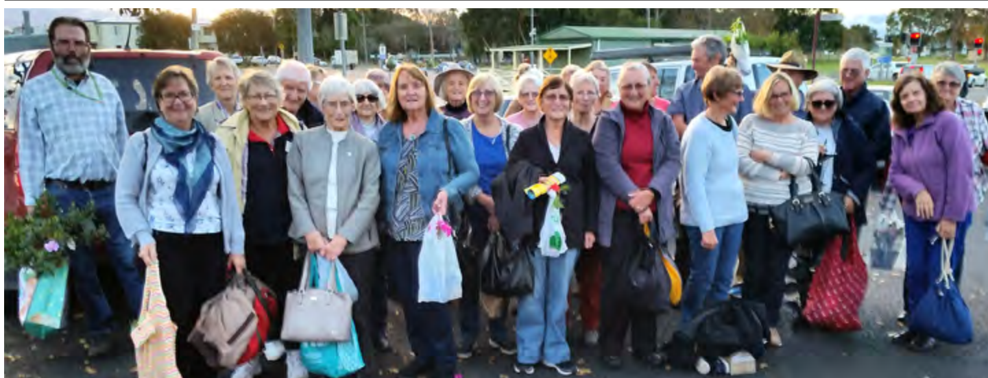
Macleay Social Gardeners on their visit to Coffs Harbour Botanical Gardens.