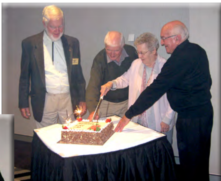
Right: Cutting the cake, 4th July, 2018