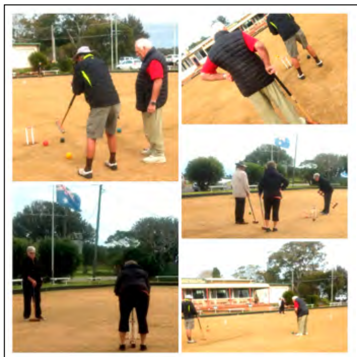
Members enjoying croquet at Smithtown.