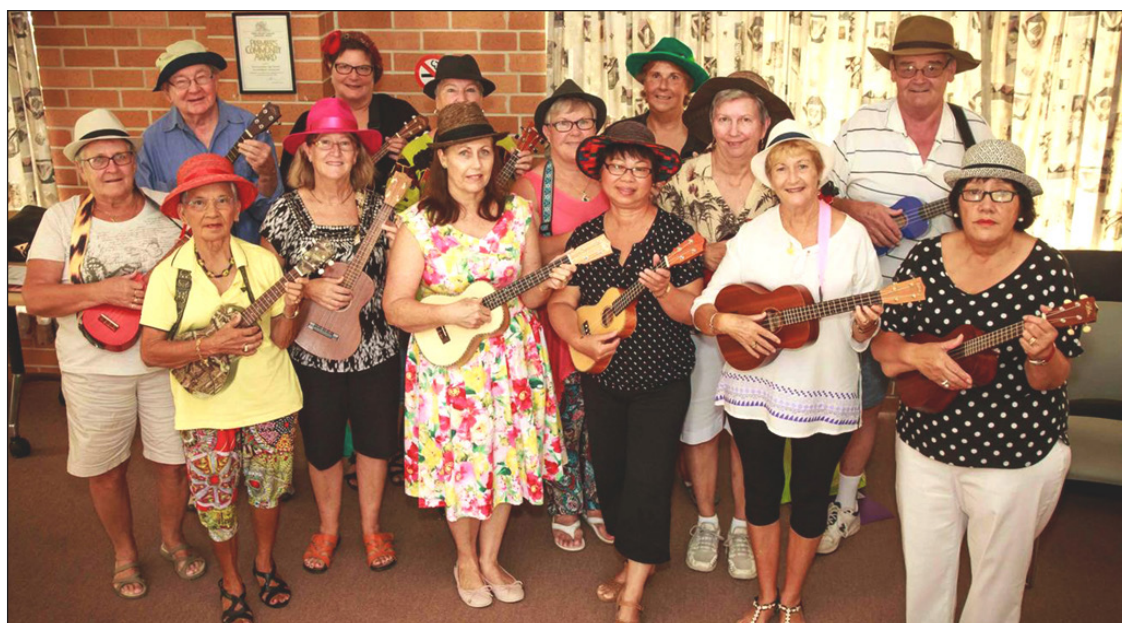
Members of the South West Rocks Ukulele group, hard at work and enjoying their class.

The Ukulele group is just one of the many enjoyable and instructional courses available through your Kempsey Macleay Valley U3A, so come and join a group of like-minded people.