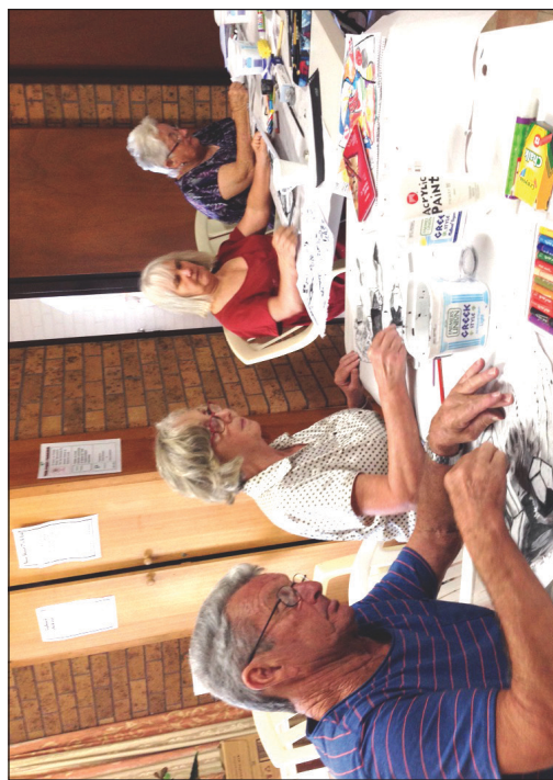
Members of the first term Drawing group busily engaged in their craft.

Why Join U3A? – An active social, mental and physical life is essential as we grow older – Keeping the brain working, especially with activities that involve new learning, is particularly advantageous.